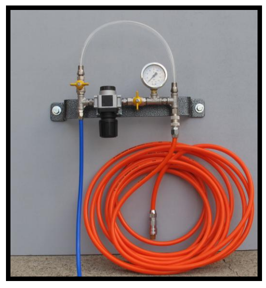
Remote Inflation Assembly

Telephone: (07) 3277 9311 Website: www.rlmdistributing.com.au