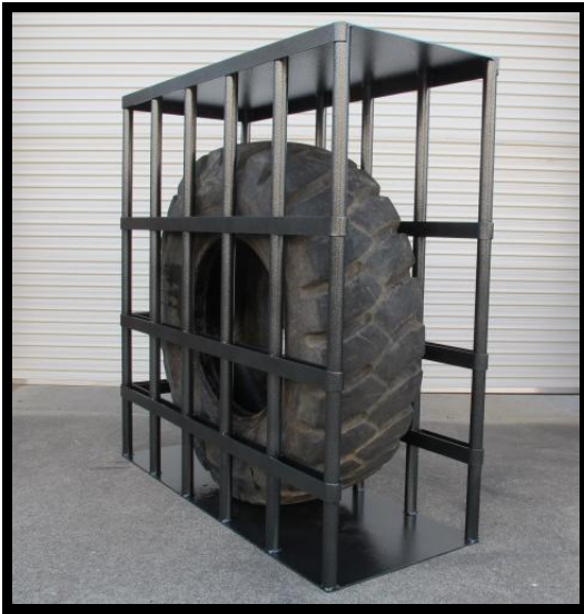
RLM – 201 Safety Inflation Cage