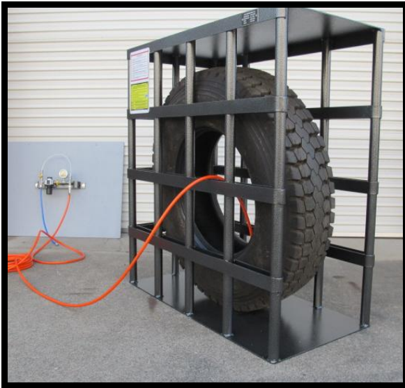
RLM – 201S Safety Inflation Cage